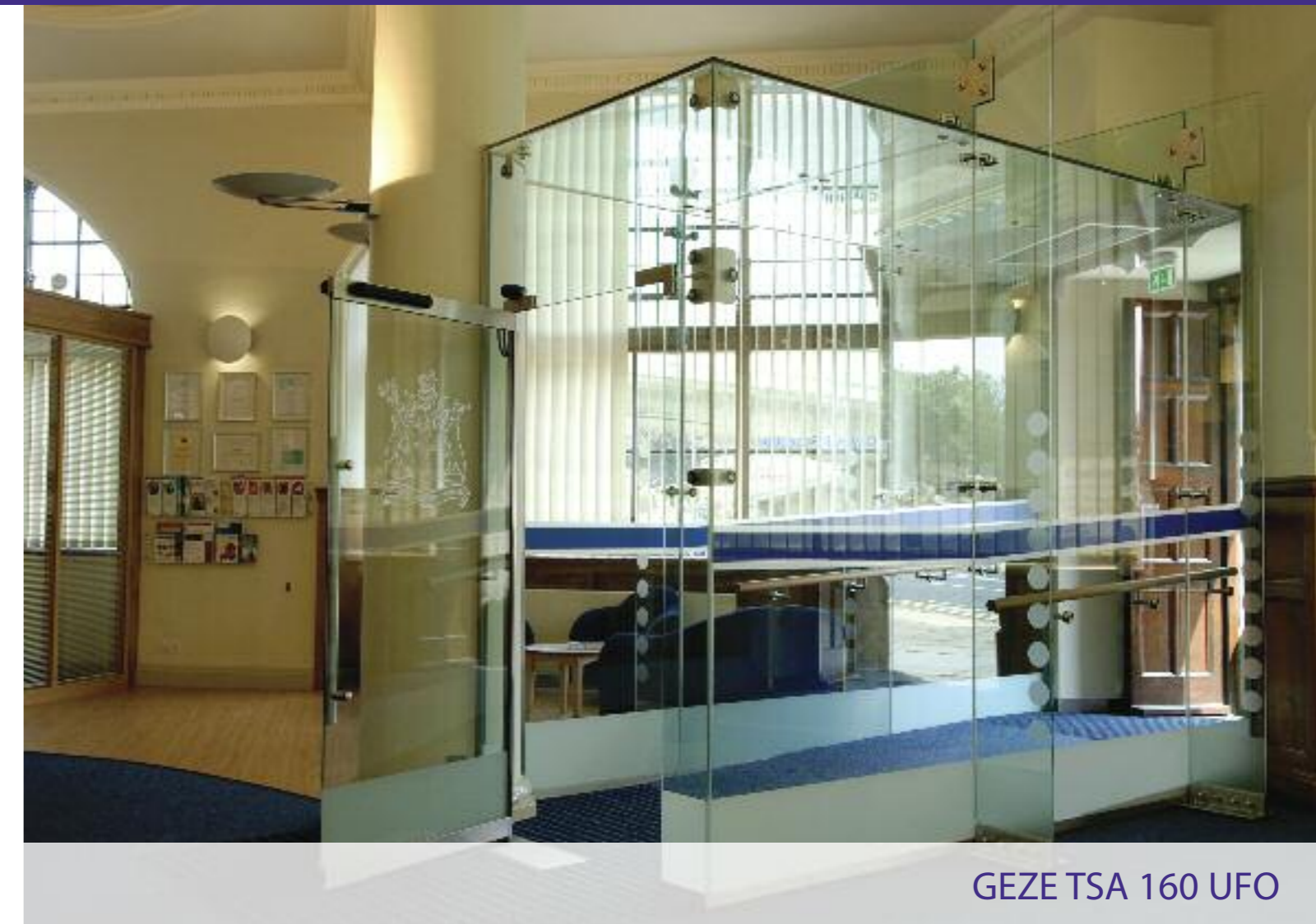
GEZE TSA 160 UFO AUTOMATIC UNDER FLOOR OPERATOR

Tel: 01543 443000 Fax: 01543 443001 Email: info.uk@geze.com Website: www.geze.co.uk