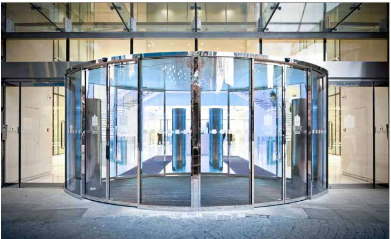
Beaufort House, London, UK