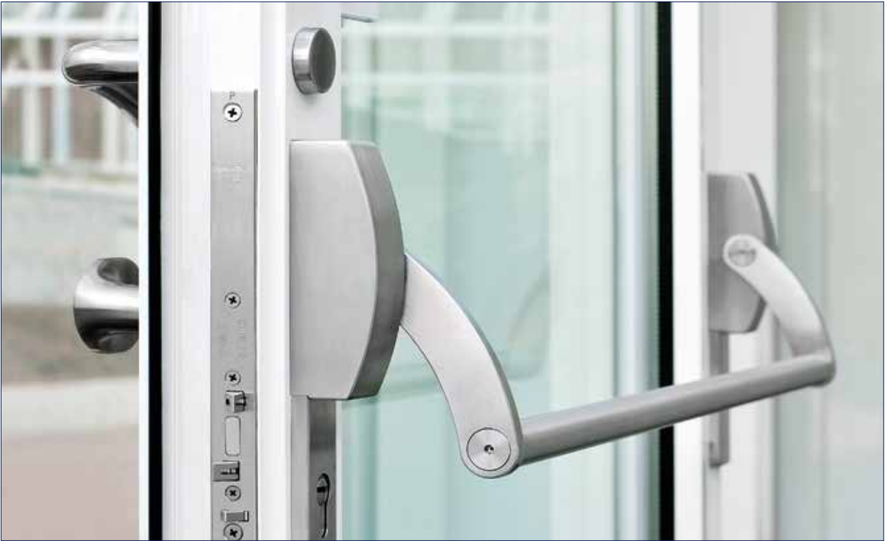
Academy of Finance, Bonn, Germany