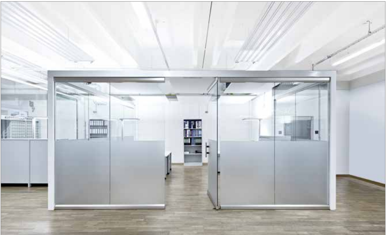
Meesenburg GmbH, Flensburg, Germany