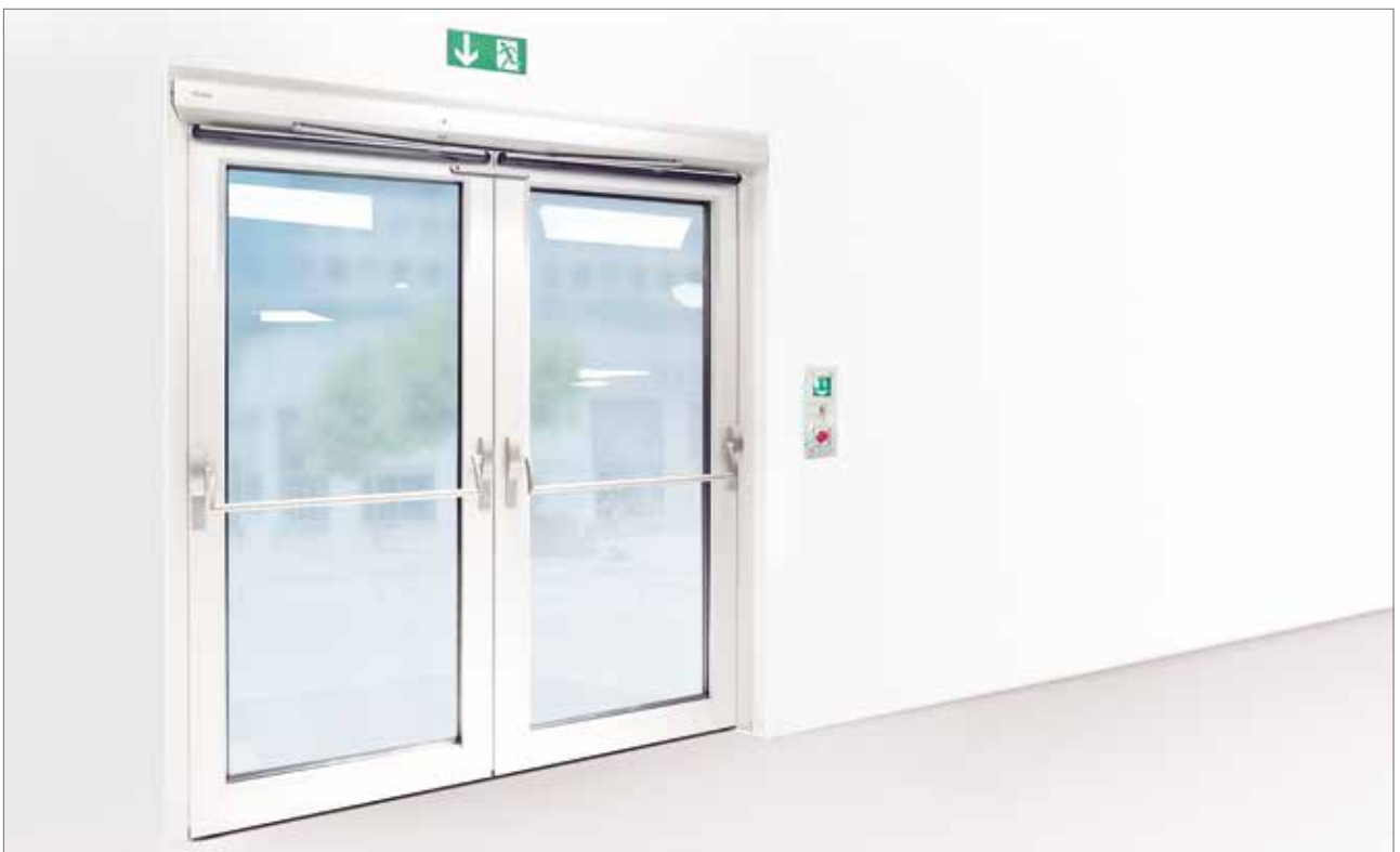
Installation situation