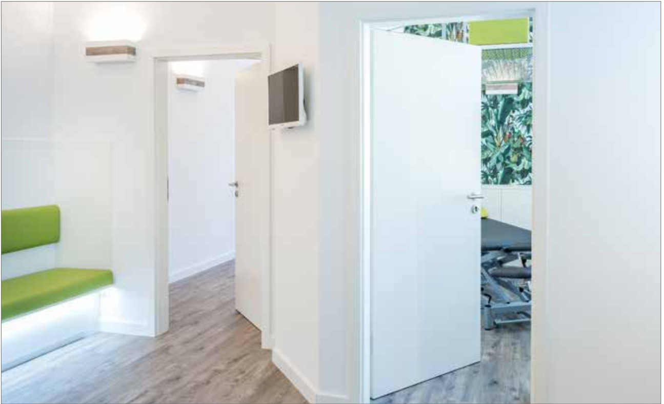
Physiotherapy practice "Behandelbar", Sindelfingen, Germany