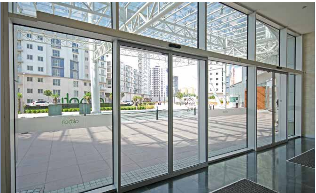
Akbati, Istanbul, Turkey