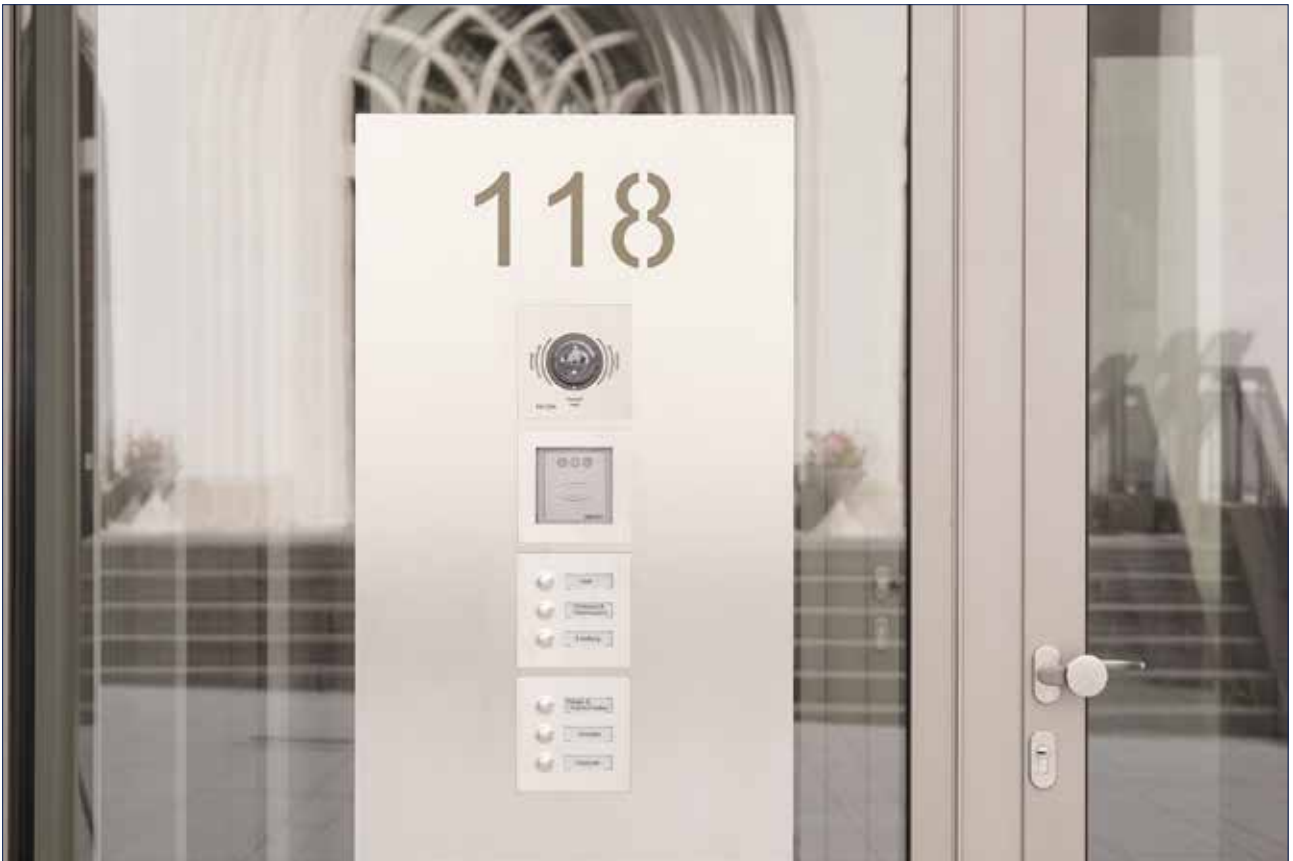
Catholic Church Administration Building, Stuttgart, Germany