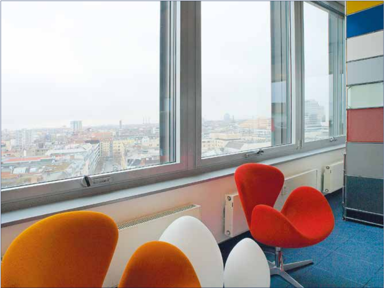
Europa Center, Berlin, Germany