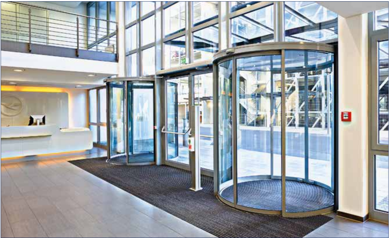
Lufthansa, Cologne, Germany