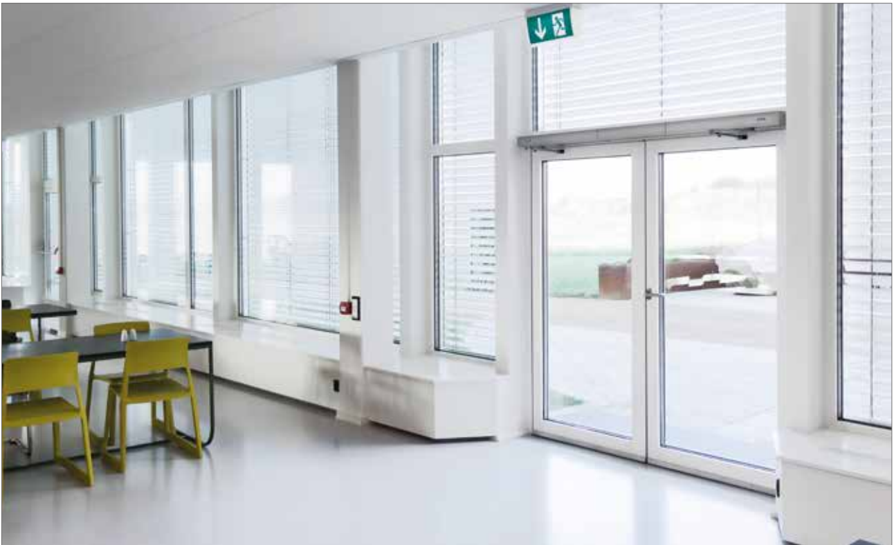
Danish association for people with disabilities, Taastrup, Denmark