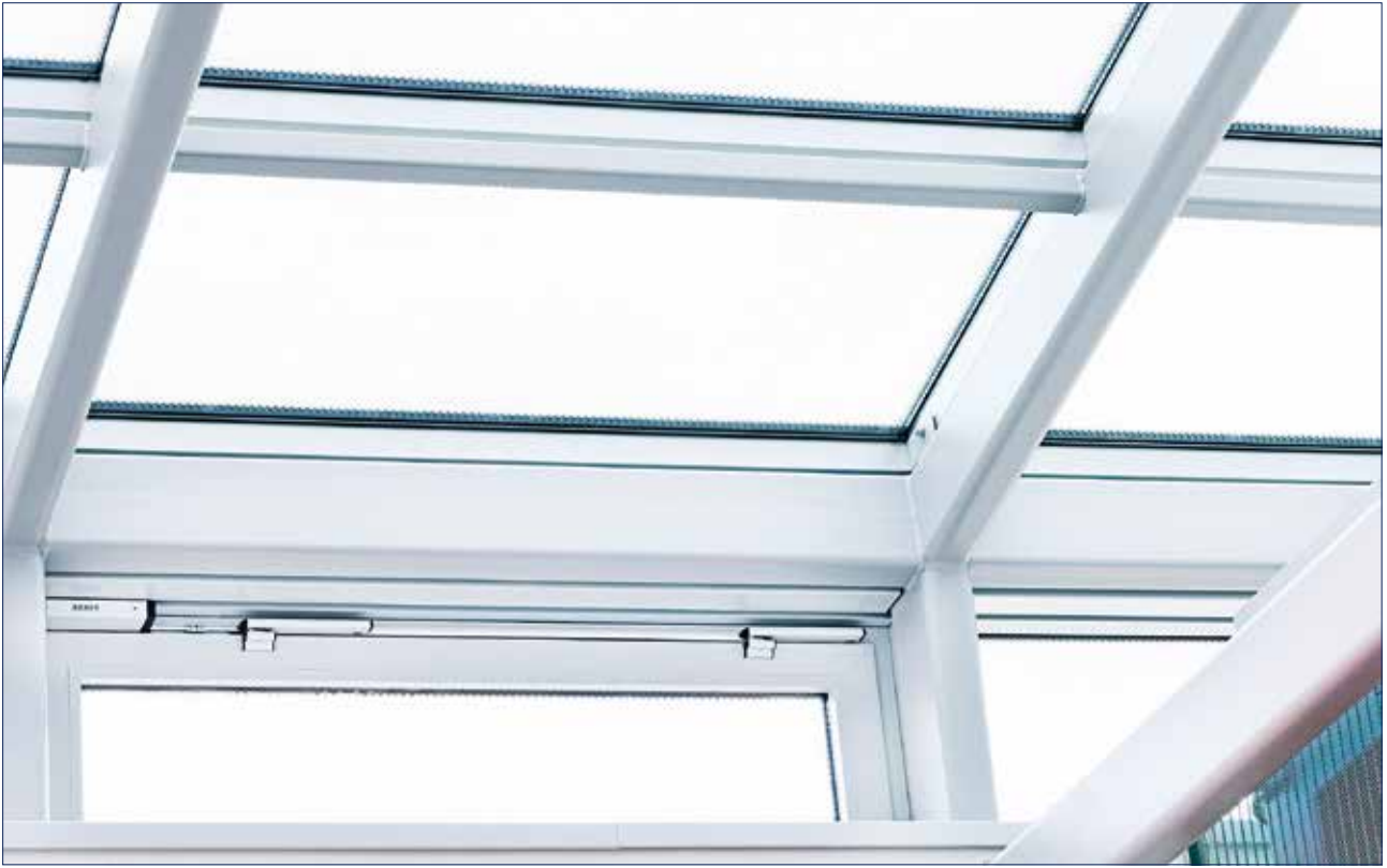
VGH Versicherungen, Hanover, Germany