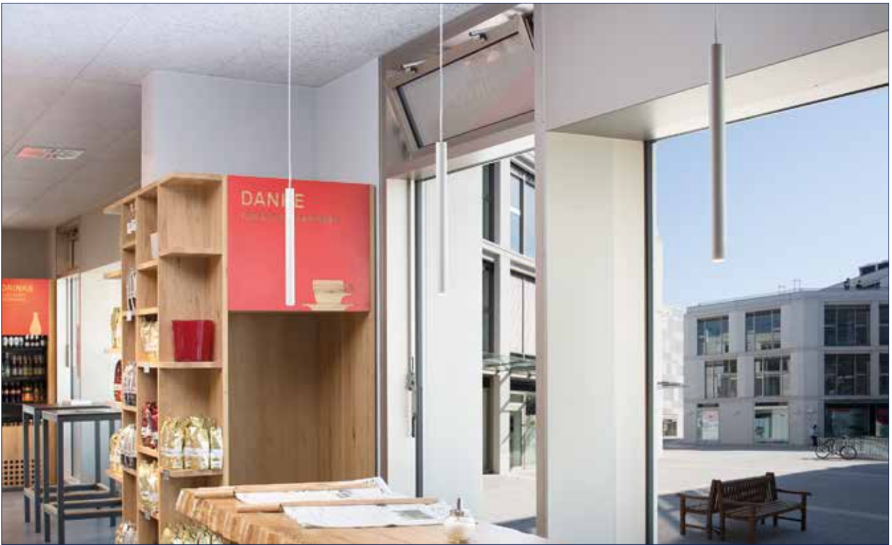
Killesberg, Stuttgart, Germany