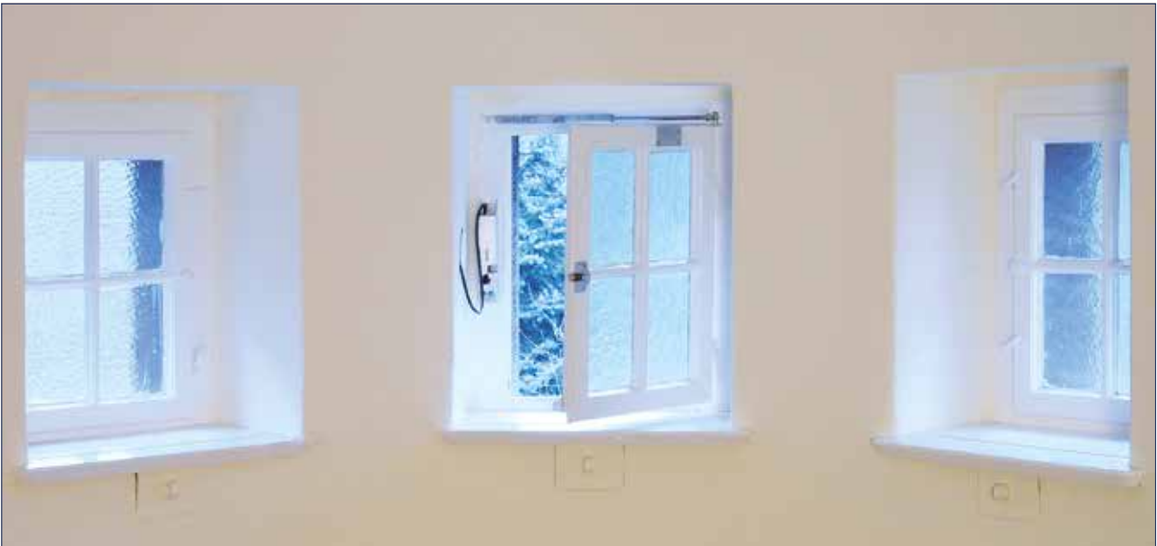
Installation situation