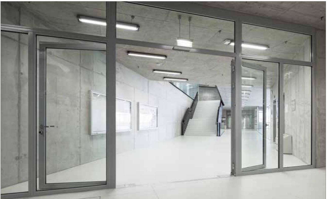
HafenCity University Hamburg, Germany