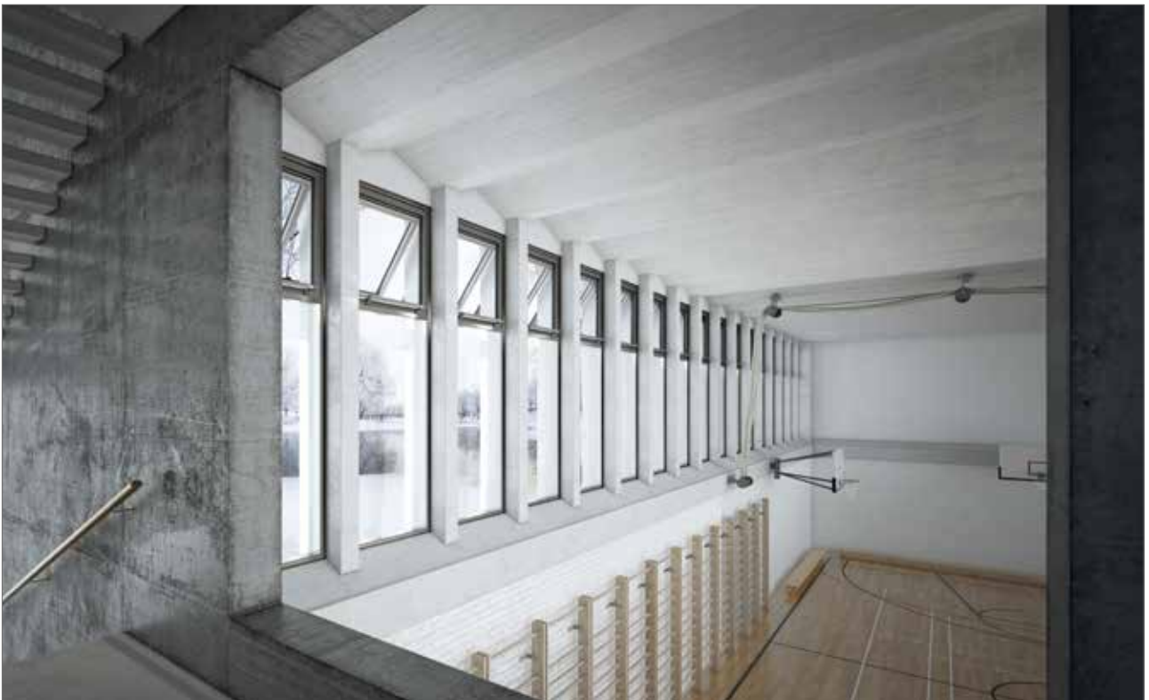
Installation situation