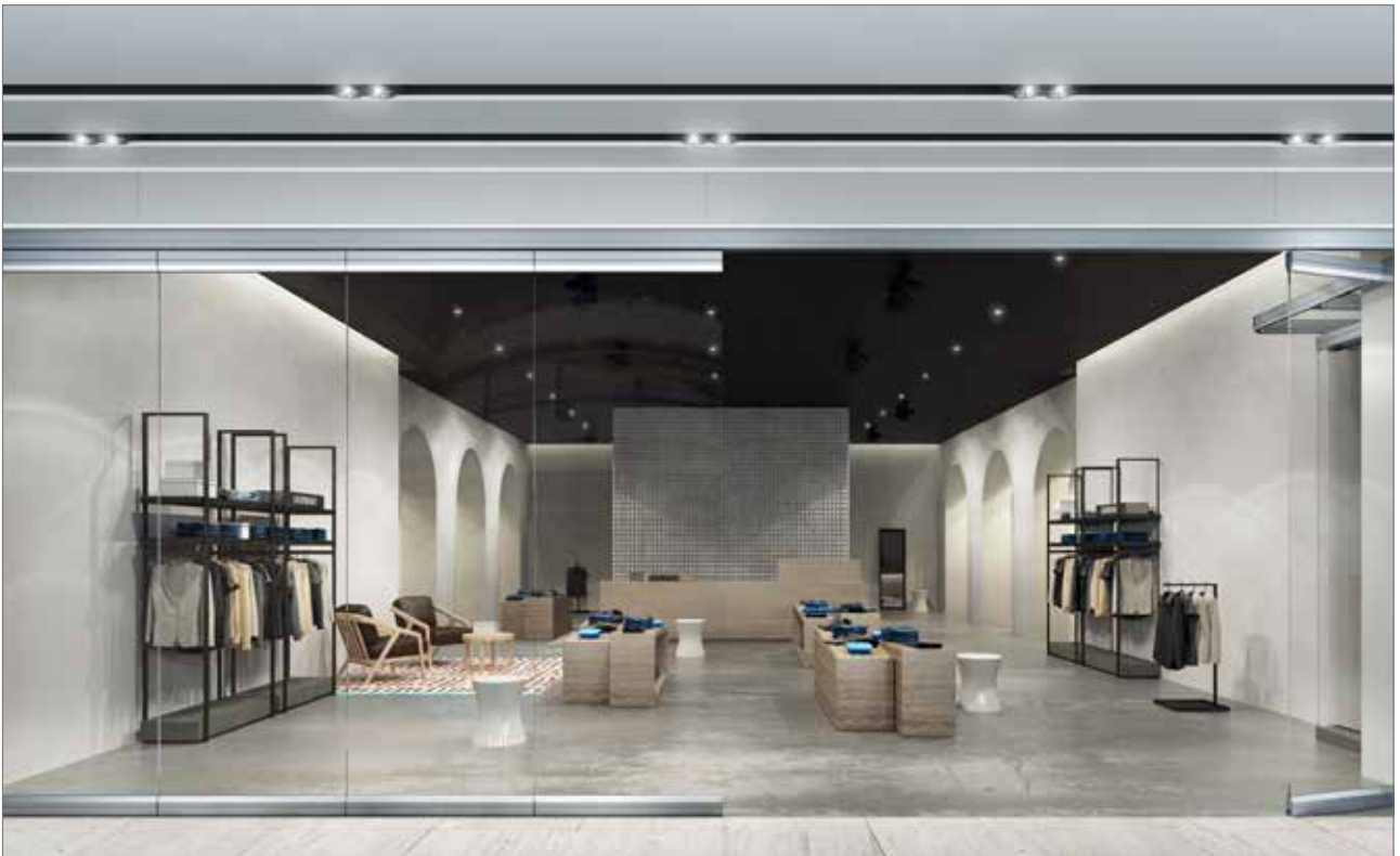
Installation situation