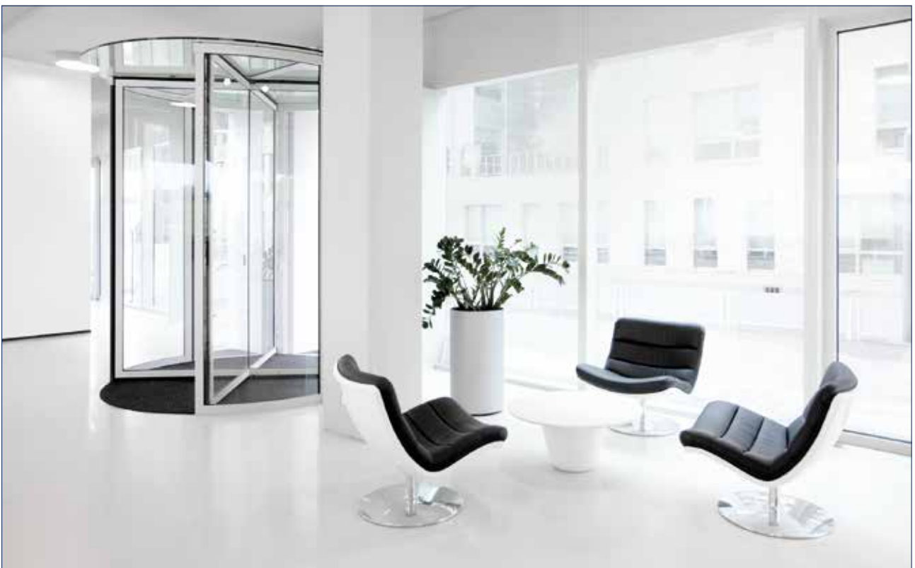
Flight Forum, Eindhoven, The Netherlands