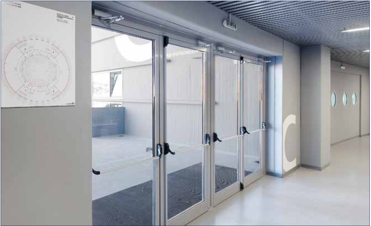
Sports hall, Zadar, Croatia