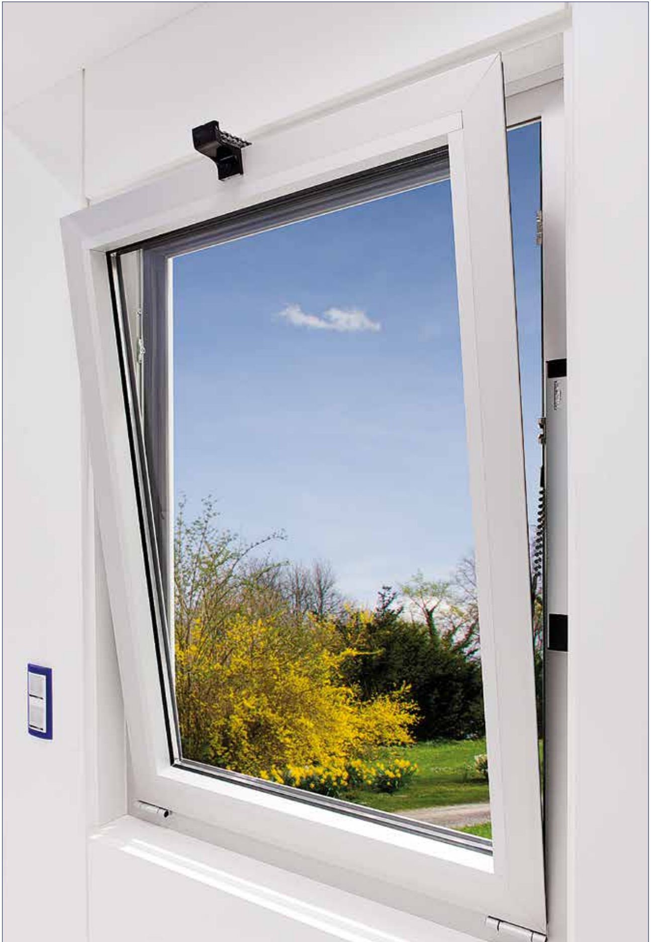
Installation situation