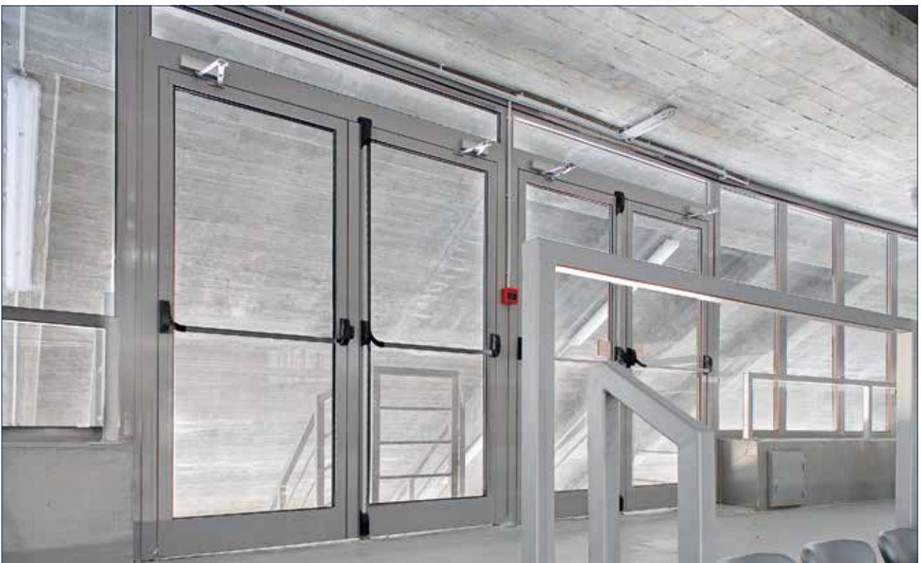
Sports hall, Zadar, Croatia