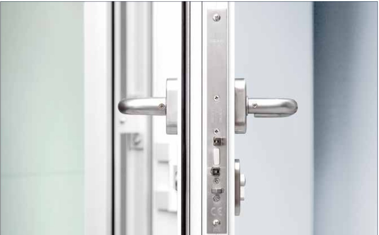
Vector, Stuttgart, Germany