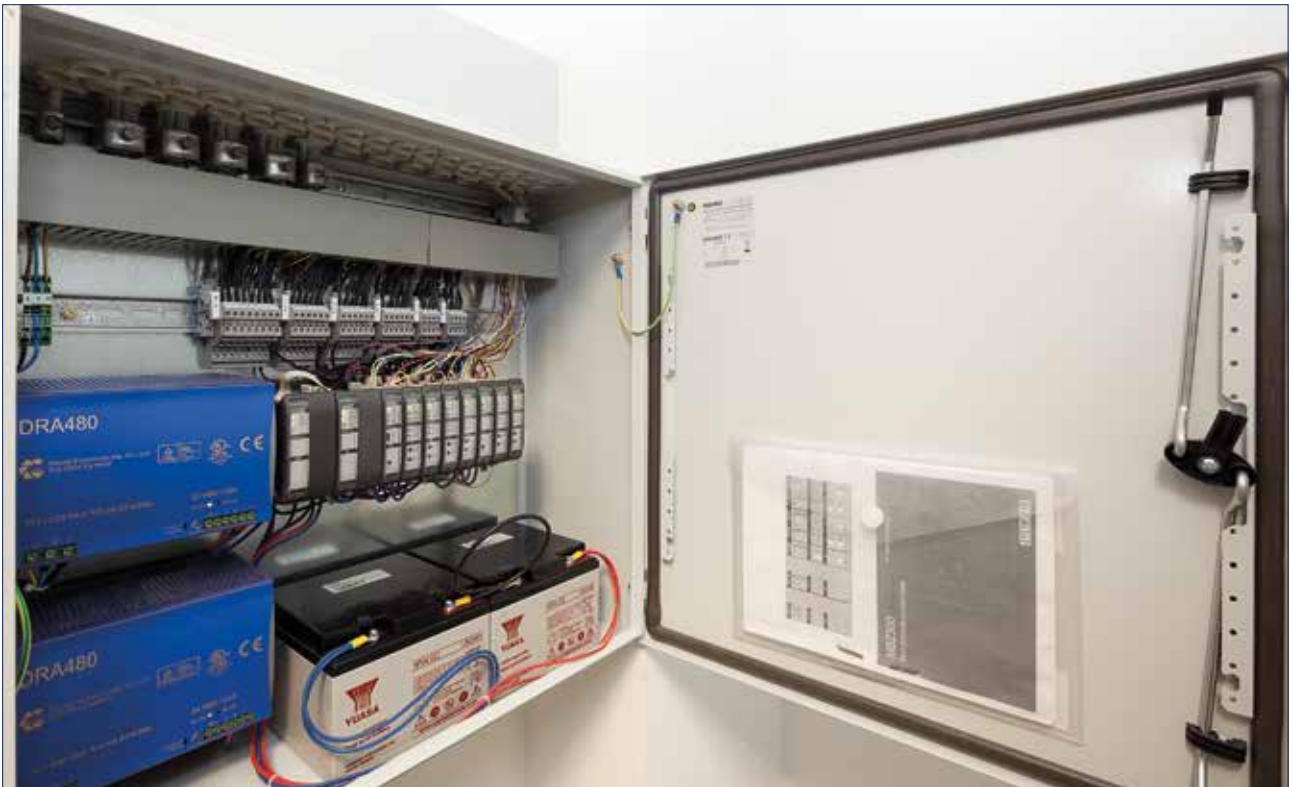
Augustinum, Stuttgart, Germany