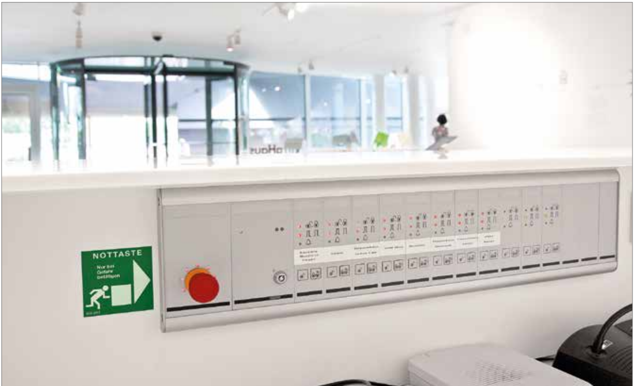
Vitra Haus, Weil am Rhein, Germany