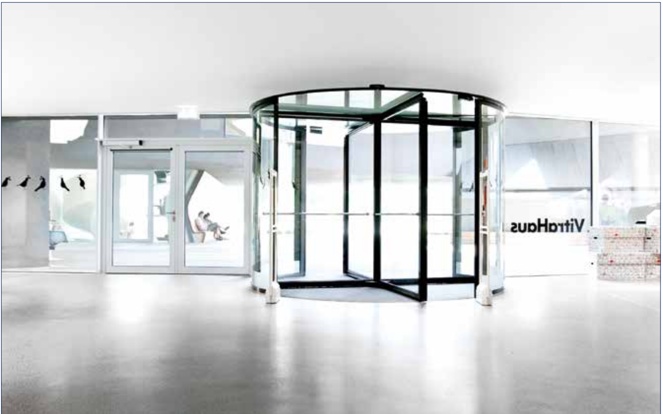
Vitra Haus, Weil am Rhein, Germany