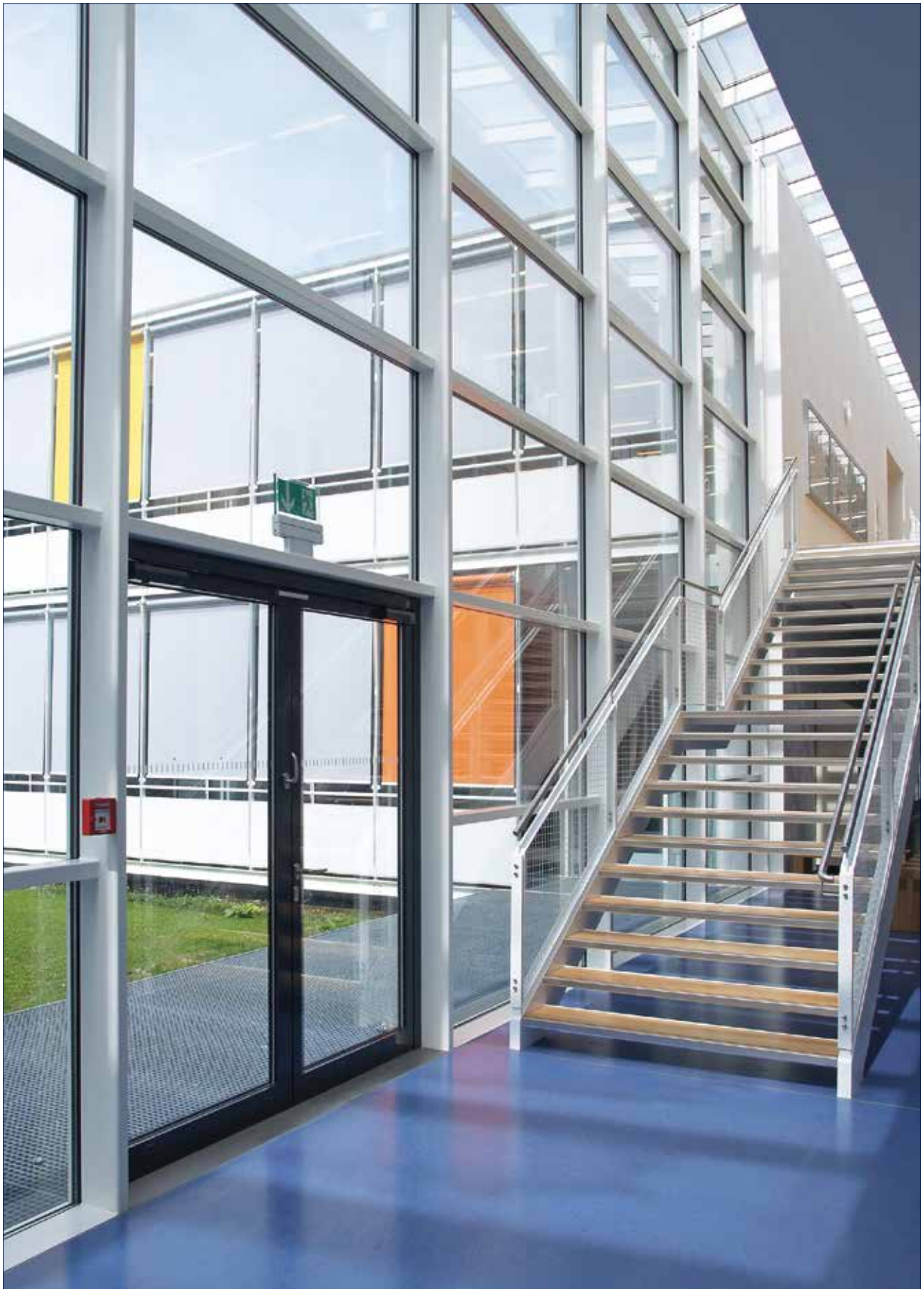
Ammersee Grammar School, Dießen, Germany