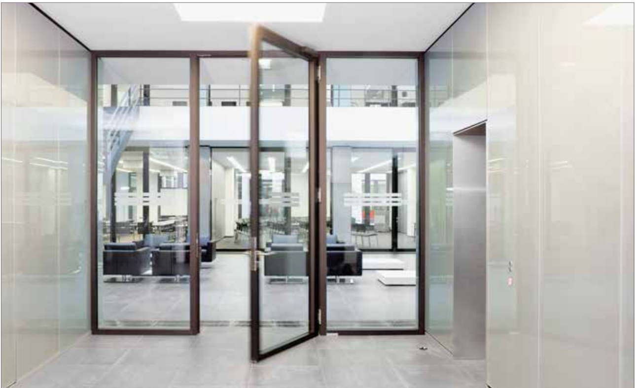
Generali, Cologne, Germany