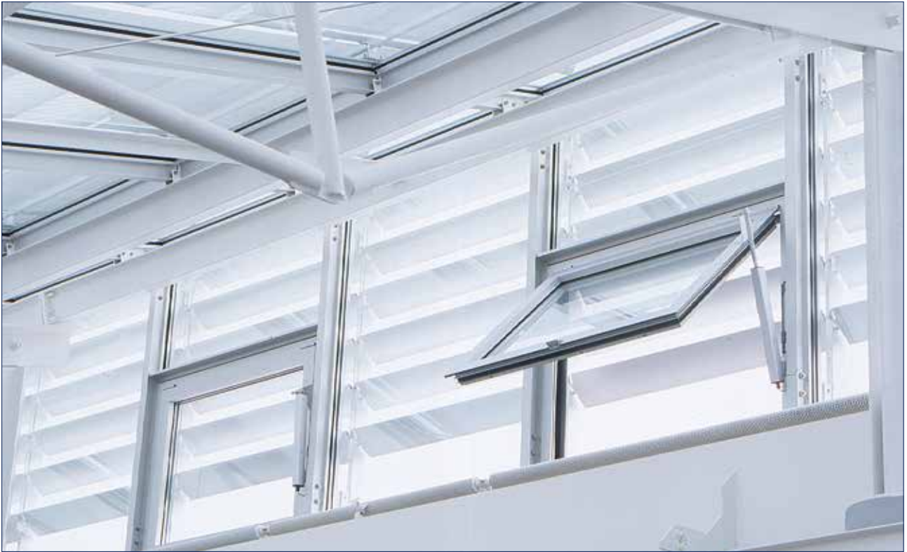
Installation situation