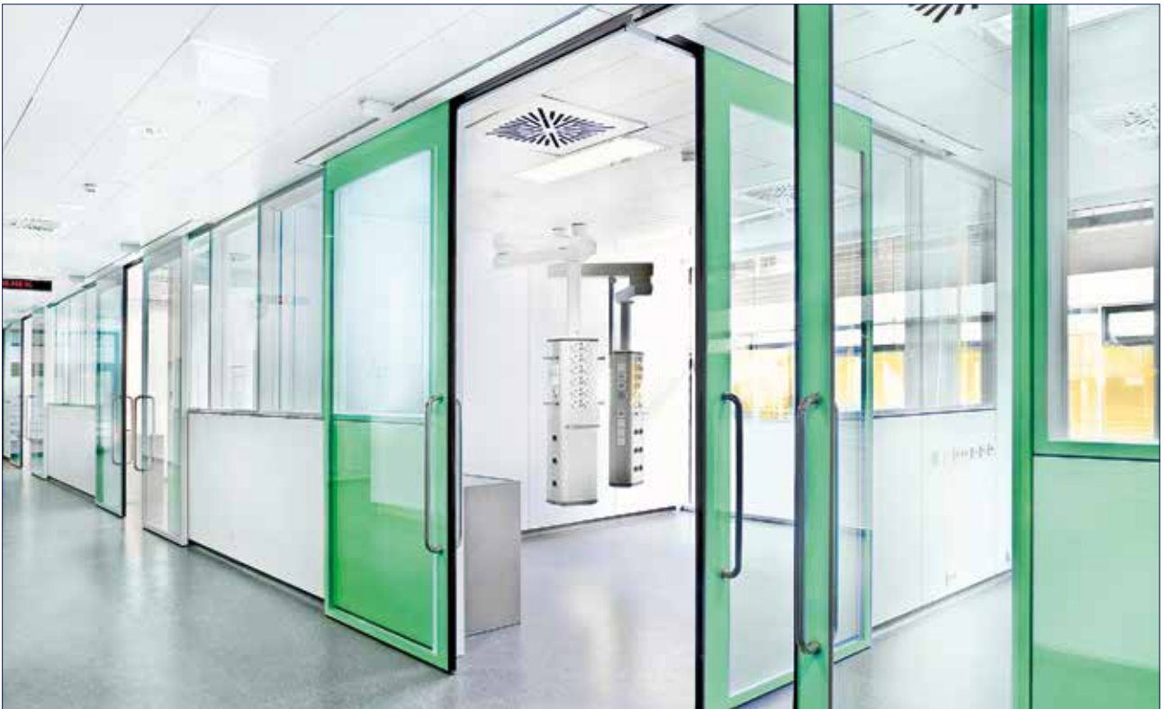
Düsseldorf Hospital, Germany