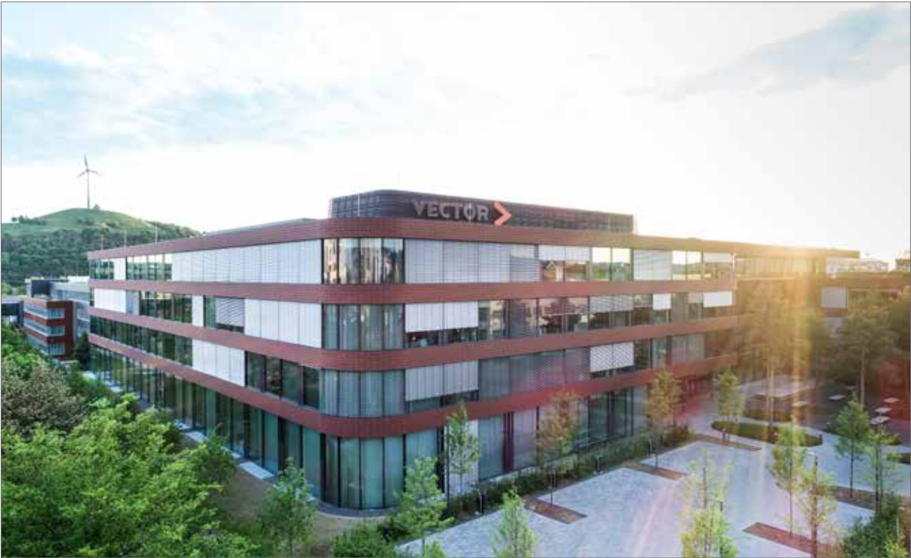
Vector Informatik headquarters, Stuttgart, Germany