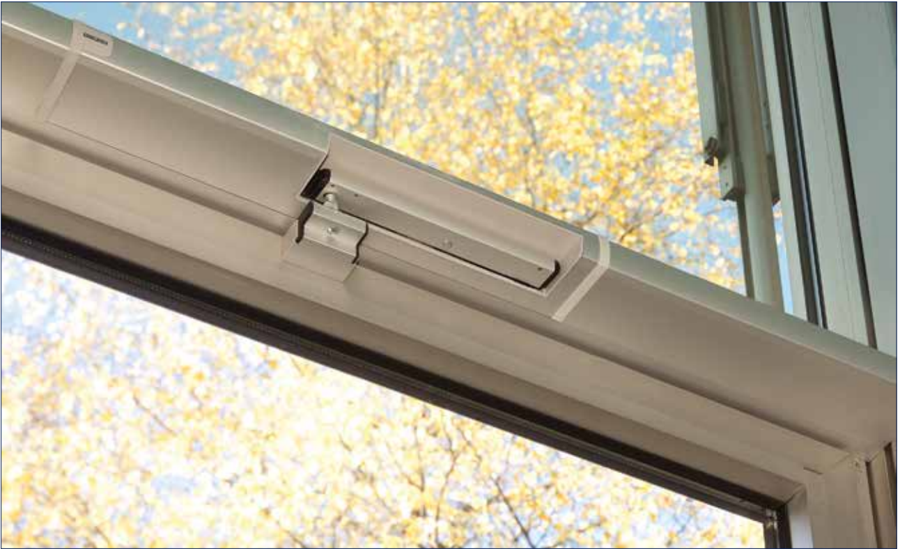
GEZE GmbH, Leonberg, Germany