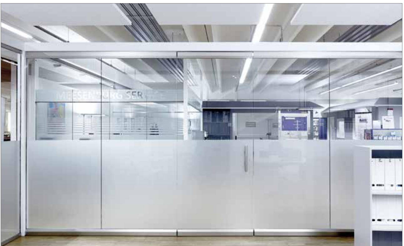
Meesenburg GmbH, Flensburg, Germany