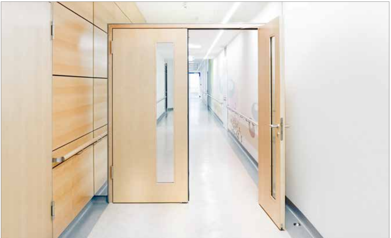
Robert Bosch Hospital, Stuttgart, Germany