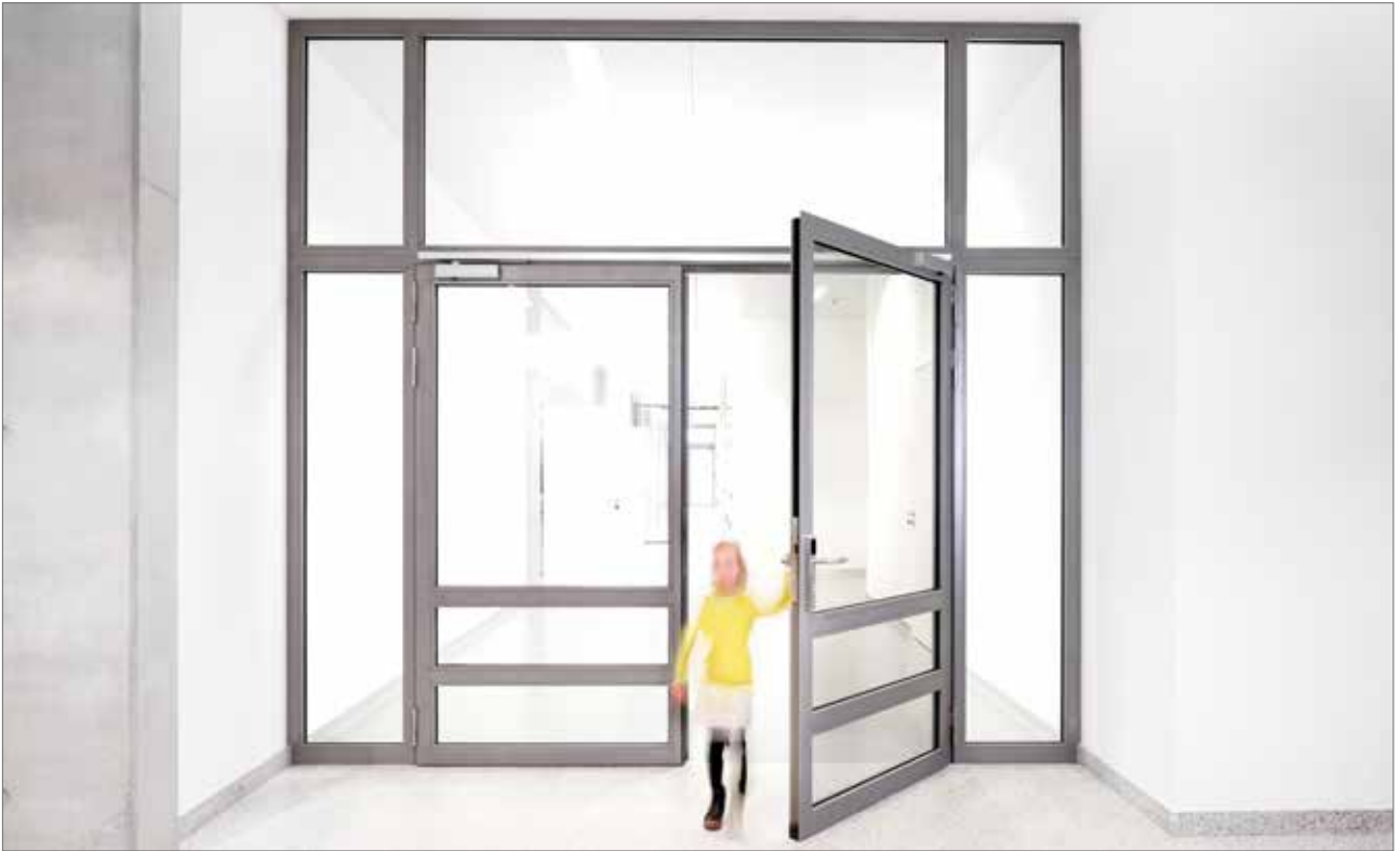
Robert Bosch Hospital, Stuttgart, Germany