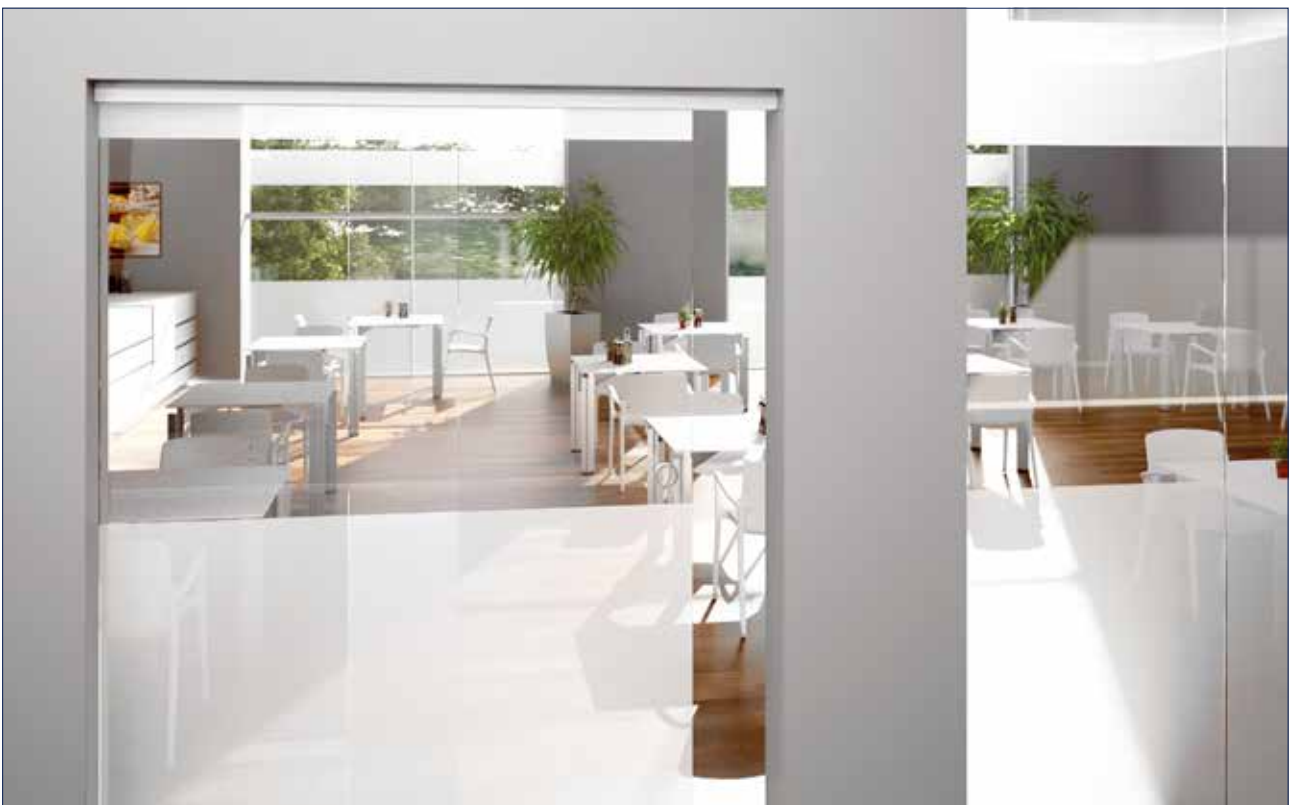
Installation situation, Restaurant