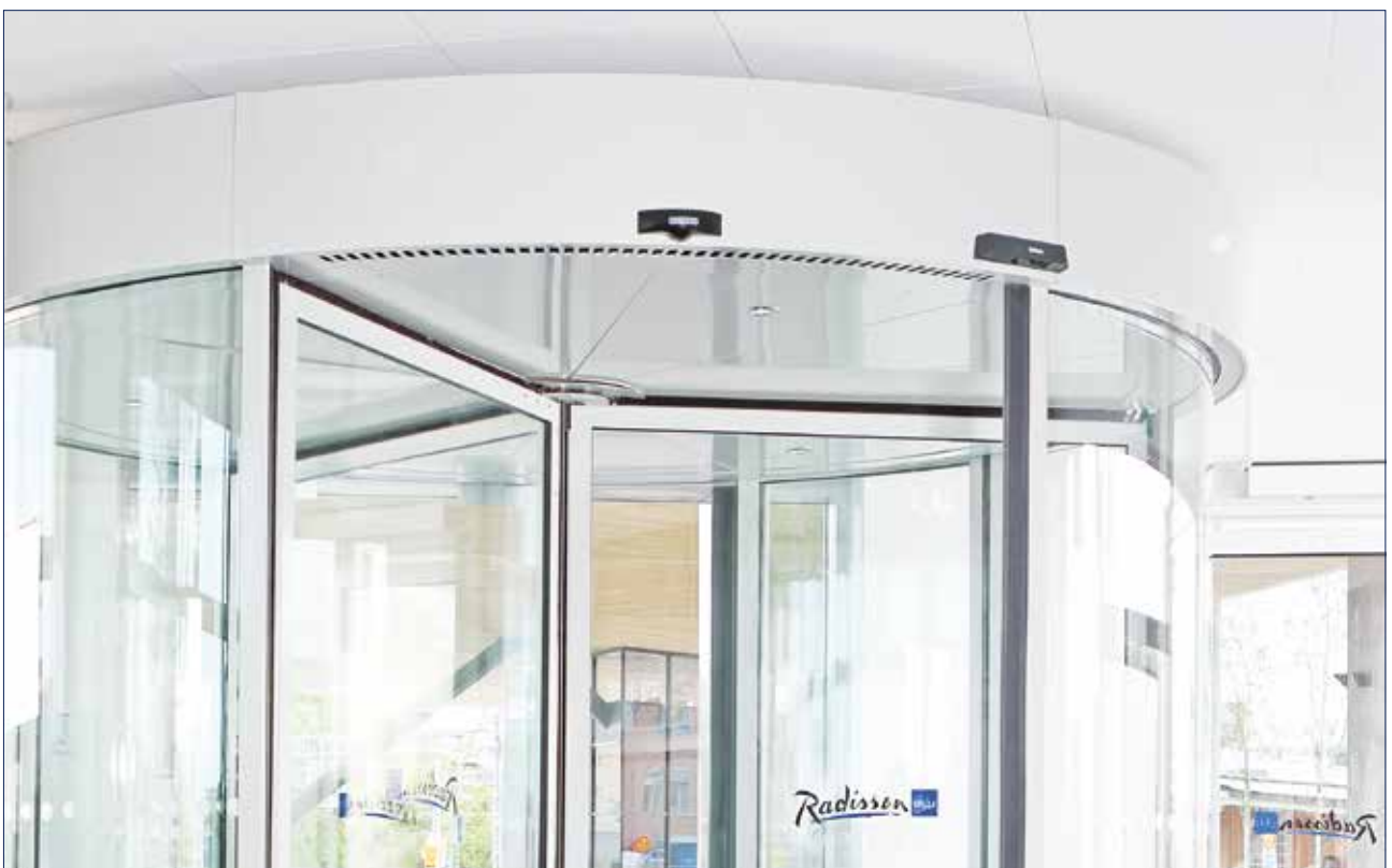
Radisson Blue Hotel, Uppsala, Sweden