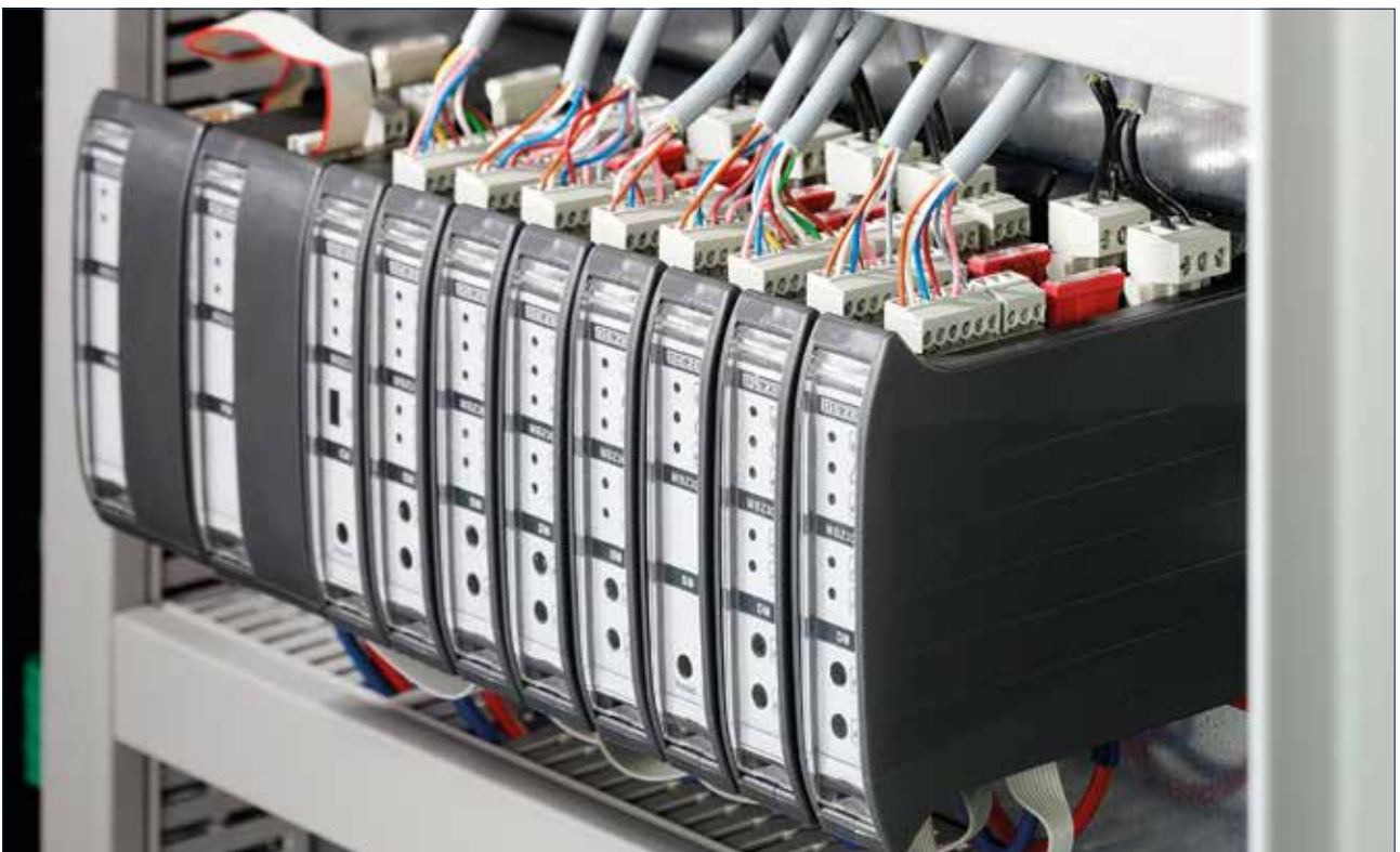
Installation situation