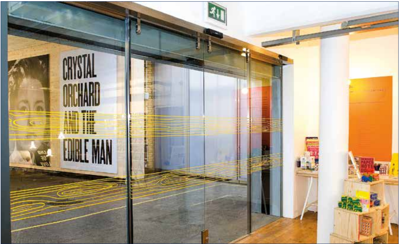
Modern Art, Oxford, Great Britain