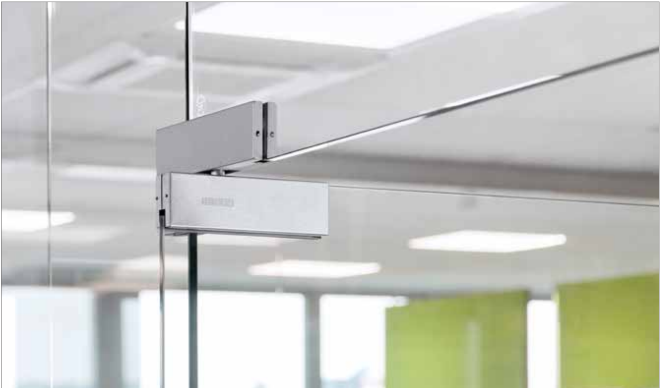
Installation situation, residential building