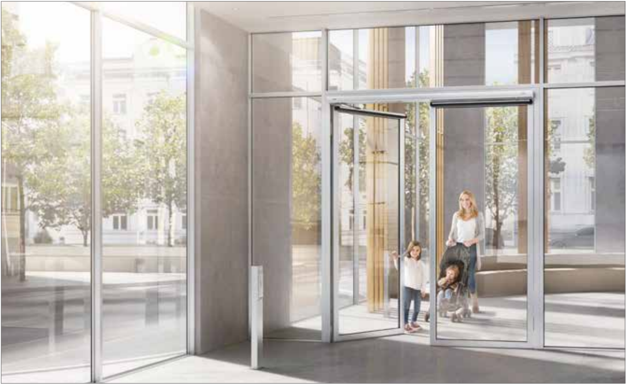
Installation situation