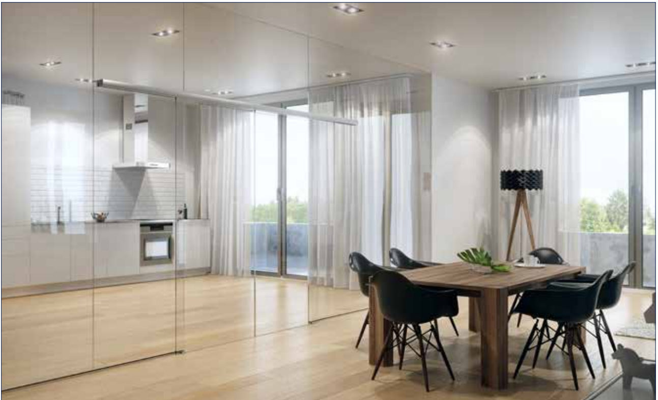
Installation situation, Residential building