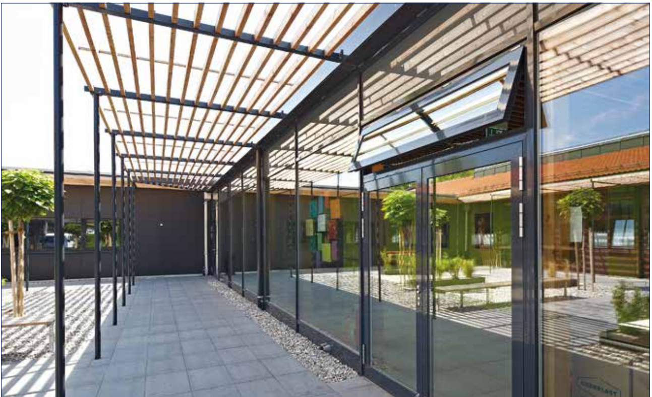
Ecksberg Foundation, Mühlendorf, Germany