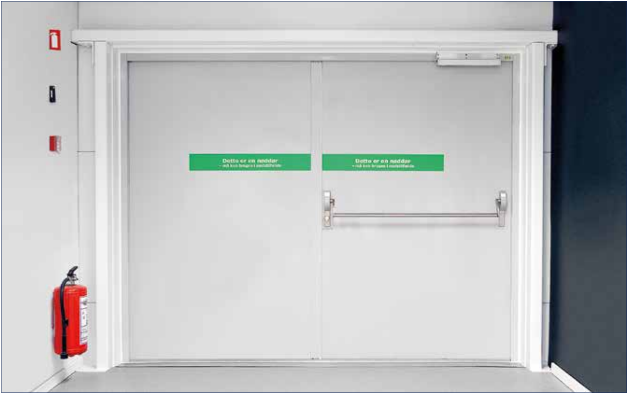
IKEA, Taastrup, Denmark