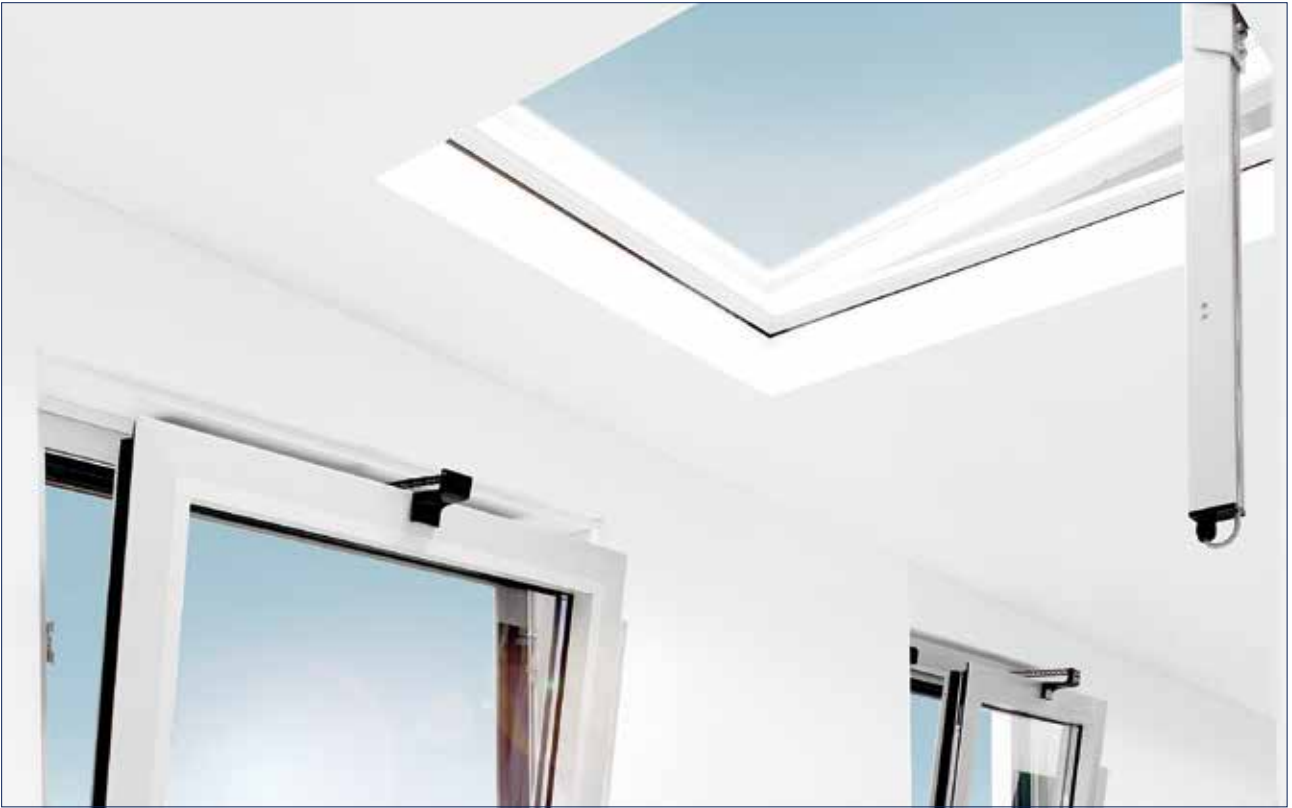
Installation situation