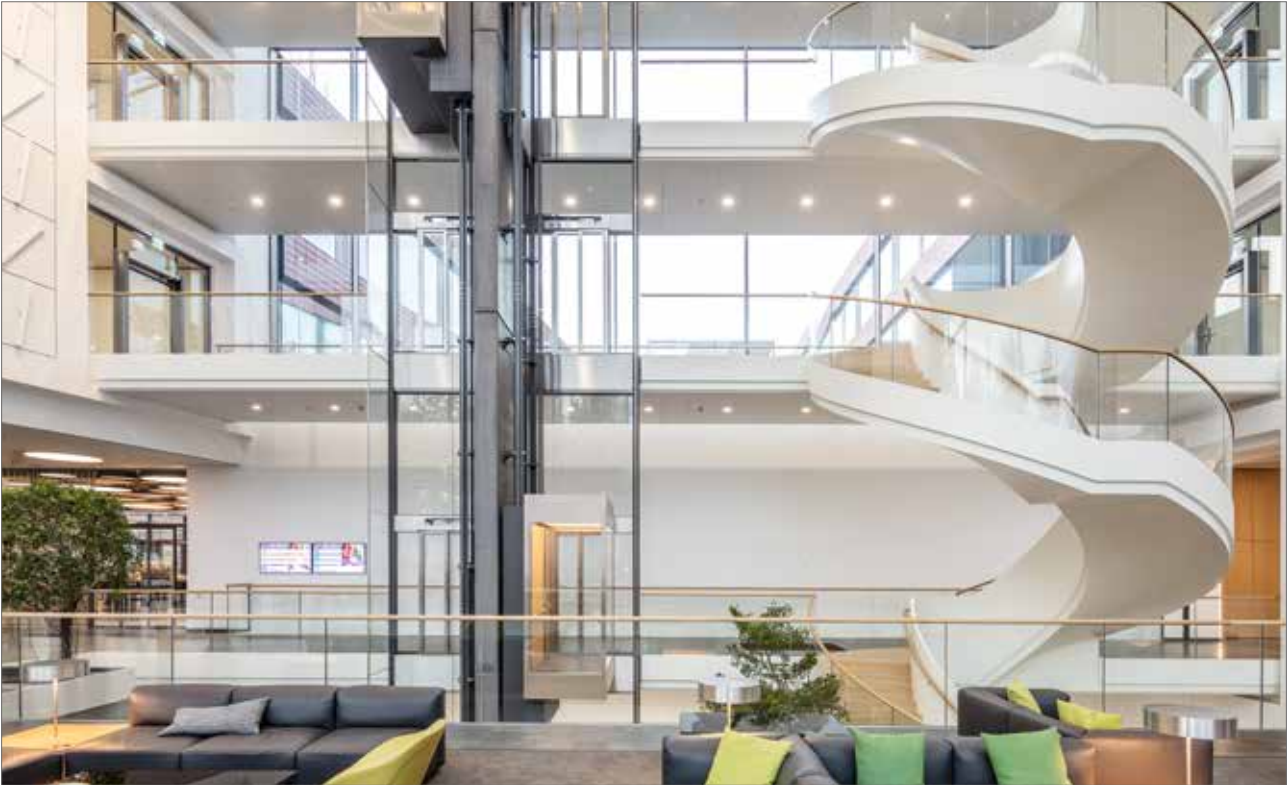
Vector Informatik headquarters, Stuttgart, Germany