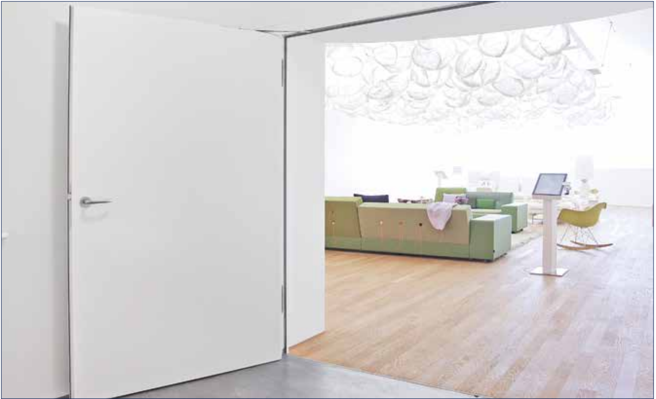
Vitra Haus, Weil am Rhein, Germany