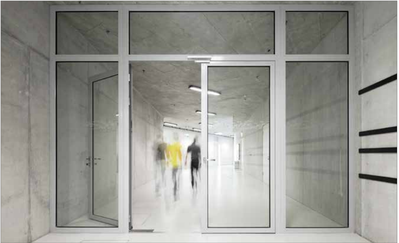
HafenCity University Hamburg, Germany