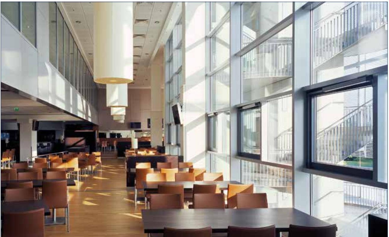
LTU Arena, Düsseldorf, Germany