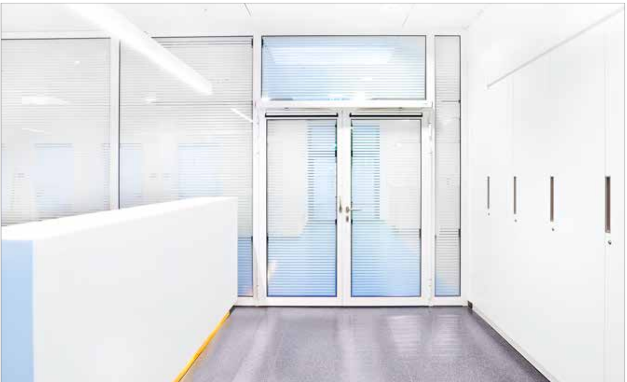
Düsseldorf Hospital, Germany