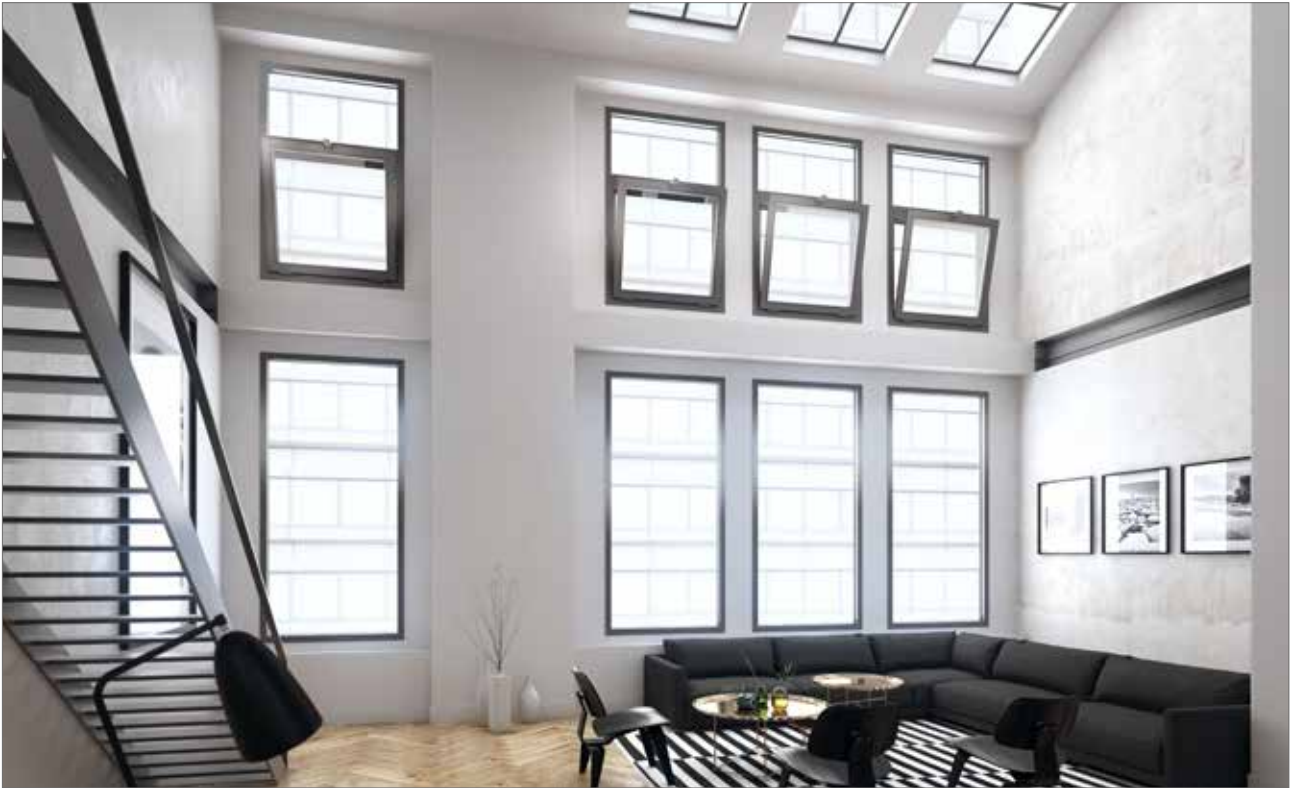
Installation situation