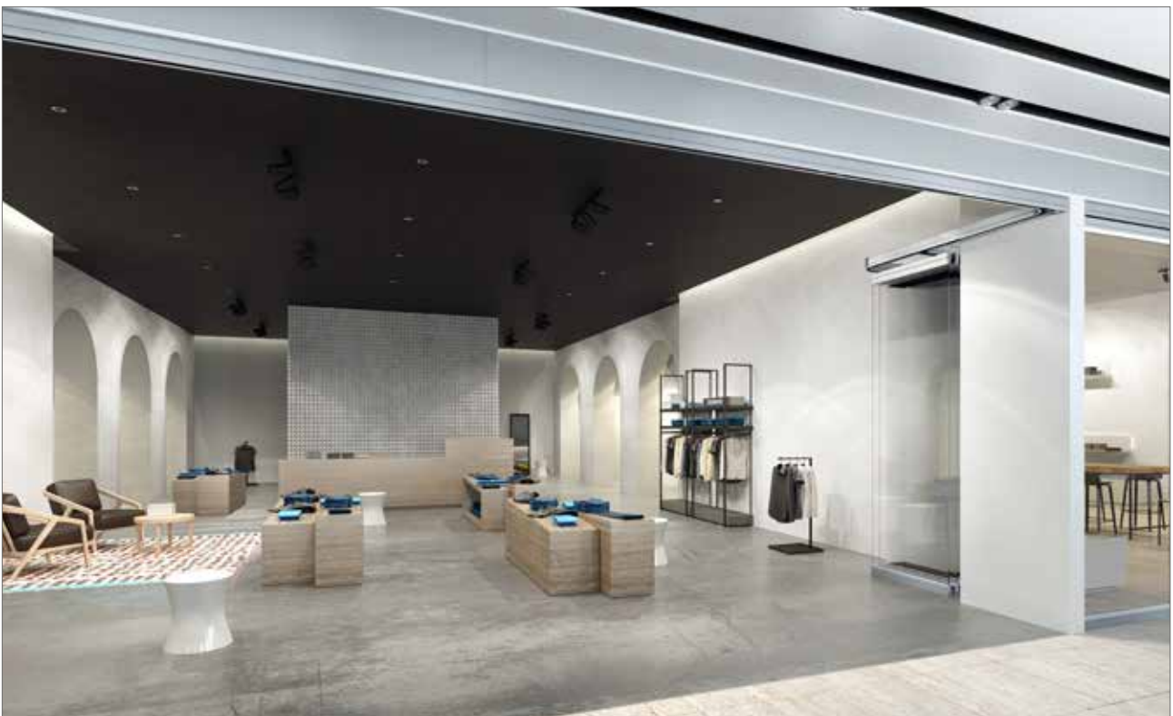
Installation situation