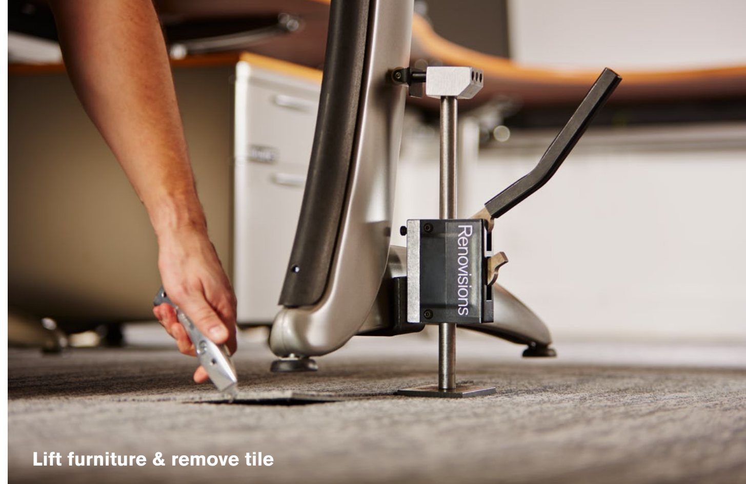
Lift furniture & remove tile

If you need to eliminate downtime altogether, we can fit your flooring outside working hours. Your staff leave in the evening, and return the next day to a brand new floor – and not a thing out of place.